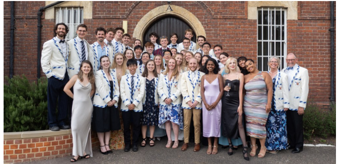
SECBC 2024-25 Mays Sports Dinner

It is hard to find the words to do justice to the week Eddie's delivered at May Bumps — unbelievable, extraordinary, historic all come to mind. To achieve a perfect record of 13 bumps from 13 races, bring home multiple sets of blades, and win the Pegasus Cup was beyond anything we had dared to dream.