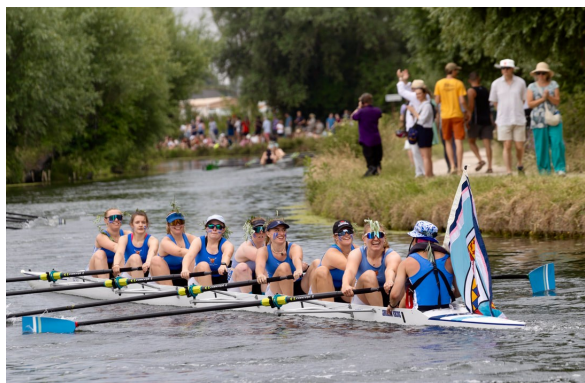
W1 achieve Super Blades at the Mays 2025

The Women's First Boat delivered a standout performance, powering through four consecutive bumps to claim super blades, secure promotion into Division 2, and reach the highest spot an Eddie's women's boat has ever achieved at the Mays.