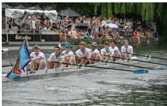
M1 achieve Blades at the Mays 2025

Meanwhile, the Men's First Boat stormed their division to take blades for the first time in fifteen years, a landmark achievement that speaks volumes about the program's upward trajectory.