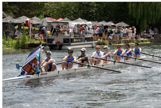
M2 achieve Blades at the Mays 2025

The future of Eddie's rowing in the 2025-26 season looks exceptionally bright.