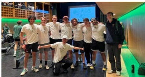
Novice men place 4th at QERGS finals

The novice men got off to a great start with an impressive 4th in the QERGS final. On the water they showed tremendous resilience in their early racing season. After tough draws and challenging conditions at Emma Sprints, they returned at Clare Novice Regatta with a hugely improved performance, pushing their opponents to the line in one of the closest races of the day. Their determination and rapid development promise exciting seasons ahead.